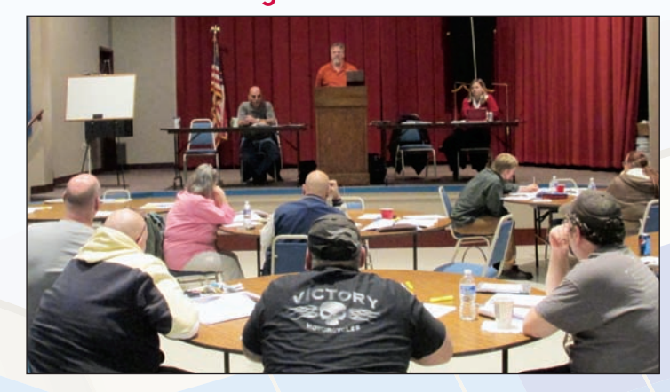
Local 322 Hosts Fishgold Arbitration Training for Local representatives