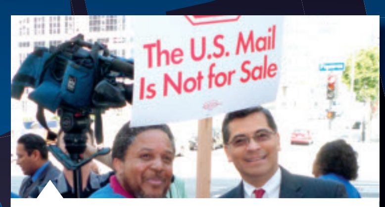
LOS ANGELES, CALIFORNIA