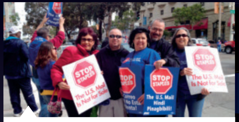
SAN FRANCISCO, CALIFORNIA