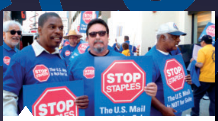
LOS ANGELES, CALIFORNIA