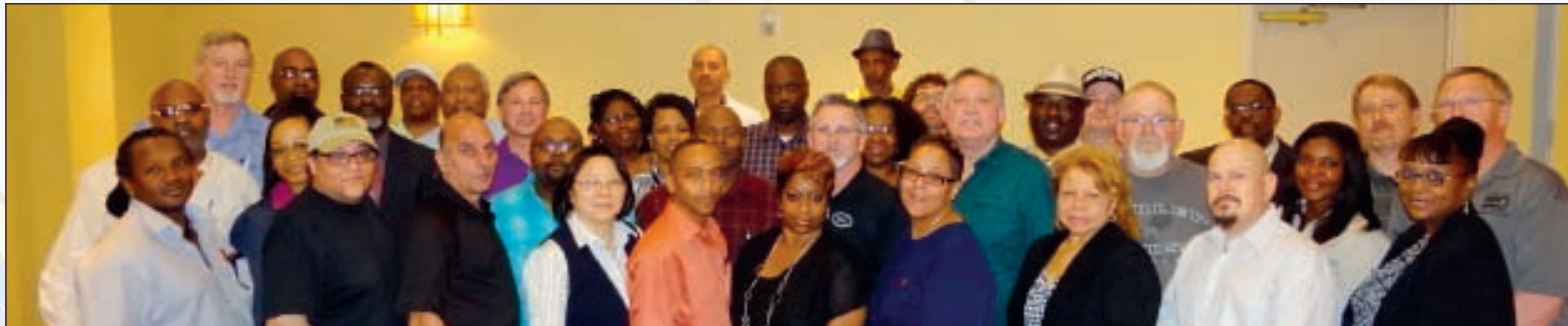
Local 311 conducts comprehensive shop steward training program