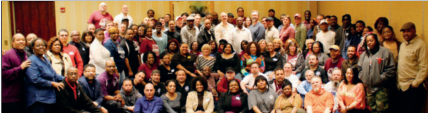
Local 306 stewards gather for comprehensive training program