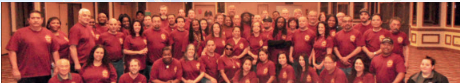
Local 302 representatives participate in shop steward training in Reno, NV