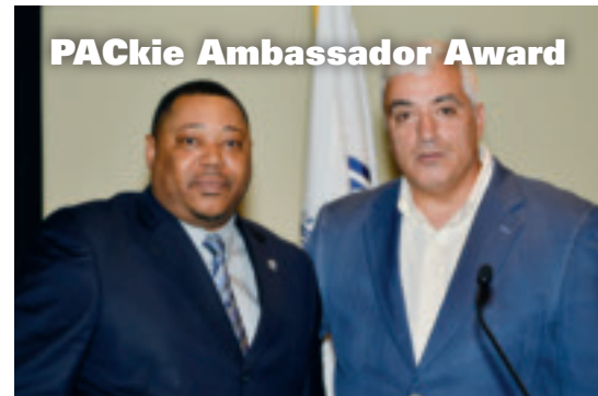
PACkie Ambassador Award