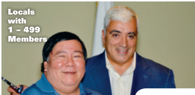
Locals with 1 - 499 Members

The winners exemplify excellence amongst our NPMHU locals.