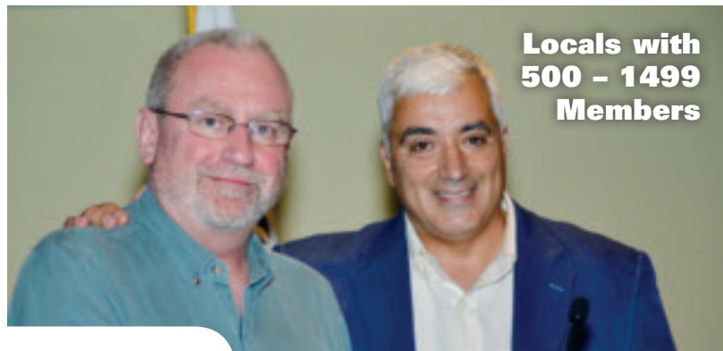
Locals with 500 - 1499 Members