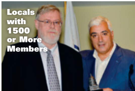
Locals with 1500 or More Members