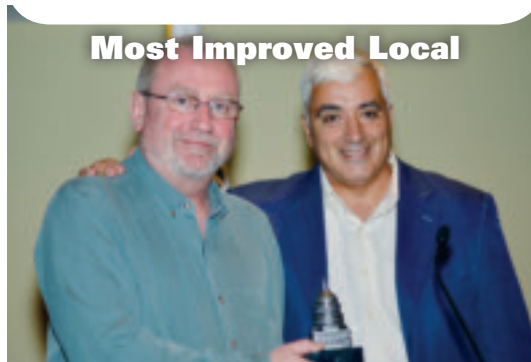
Most Improved Local