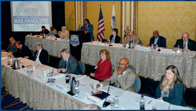
(back) National Executive Board and (front) Contract Administration Department