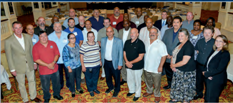
Finance Management Seminar Attendees