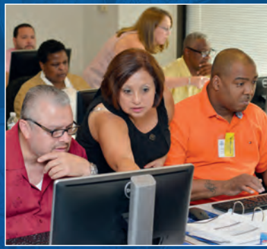
Attendees receive instructions on Union finance software