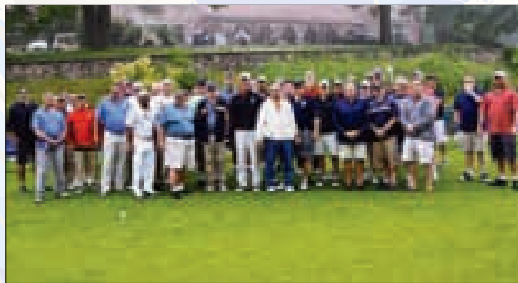
Group photo of the 2012 participants in the annual 301 fundraising event for the New England Shelter for Homeless Veterans