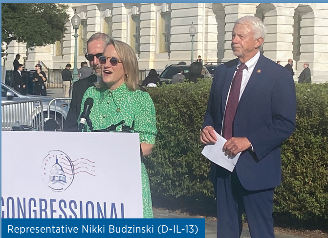
Representative Nikki Budzinski (D-IL-13)