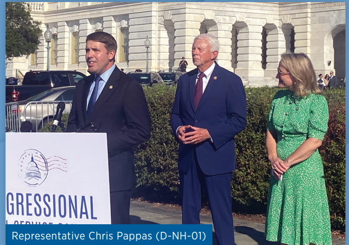
Representative Chris Pappas (D-NH-01)