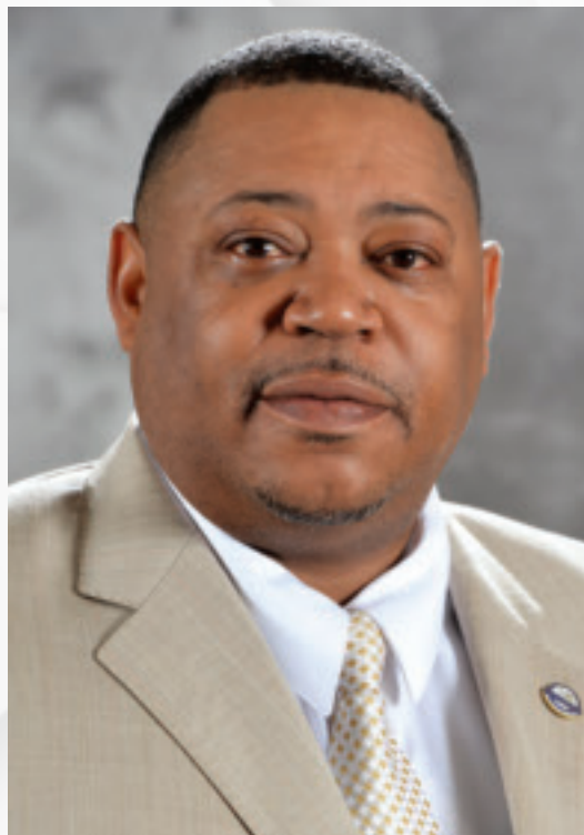
Pervous Badilishamwalimu Credentials Committee

In addition to the traditional Constitution and Resolution Committees—and in recognition of the increasing role that the NPMHU has played in ongoing legislative issues on Capitol Hill—President Hogrogian has named a Legislative Committee to review and recommend the adoption of resolutions concerning legislative and political matters.