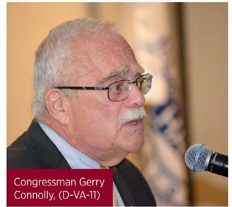
Congressman Gerry Connolly, (D-VA-11)