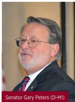
Senator Gary Peters (D-MI)