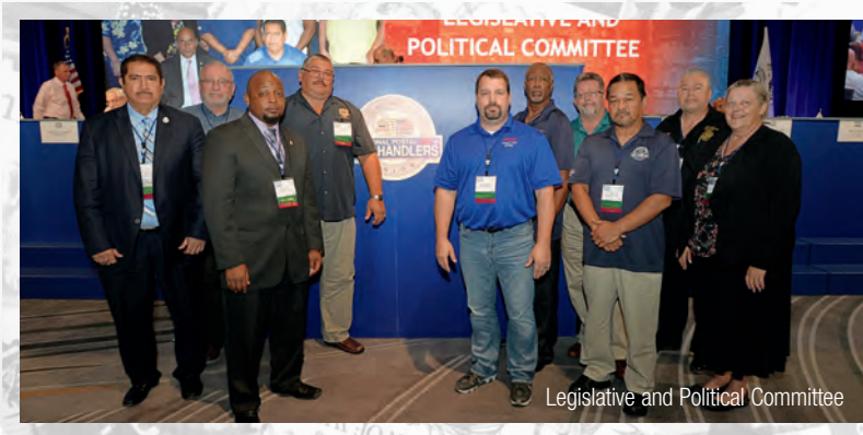
Legislative and Political Committee