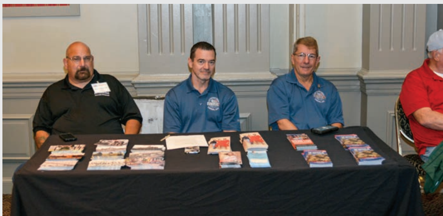
Local 308 leaders assist attendees with questions regarding local and regional information.