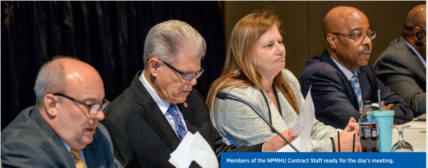
Members of the NPMHU Contract Staff ready for the day's meeting.