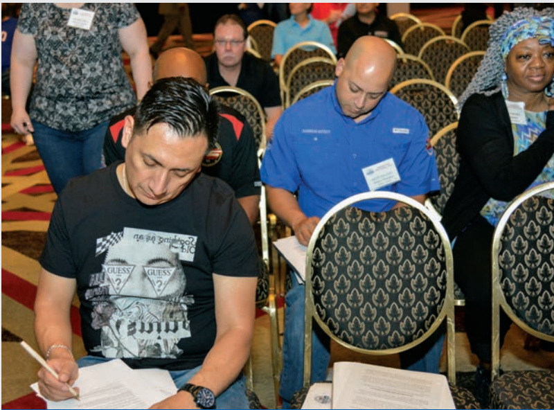
NPMHU members participate in a workplace survey conducted by the NPMHU Women's Committee