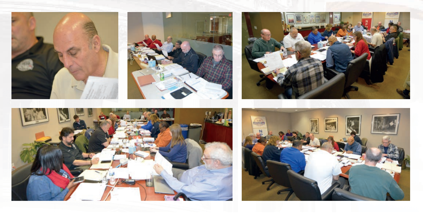
8 | National Postal Mail Handlers Union