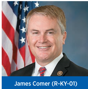
James Comer (R-KY-01)