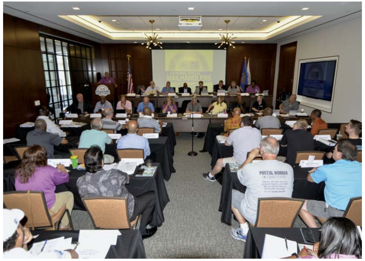
NPMHU National Officers, National CAD, Regional CAD Directors & Representatives, Local presidents and Local Union representatives engaged in an RI-399 Training on day 3 of the Semi-Annual Meeting of the Local Unions.