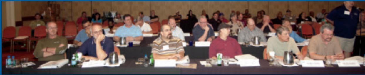
NPMHU National Presidents gather at the SAMLU.