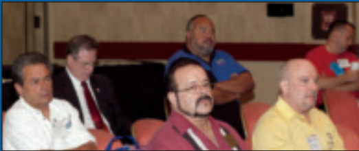
NPMHU SAMLU in progress