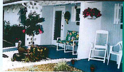
NALC's retirement community

Nalcrest is located in Central Florida, midway between Tampa and Vero Beach (eight miles from Lake Wales).